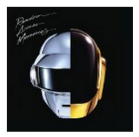
New Release Random Access Memories Daft Punk $11.88 Why recommended?