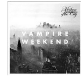
New Release Modern Vampires of th... Vampire Weekend $9.99 Why recommended?